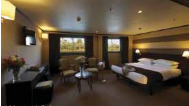
M/S Presidential Nile Cruise